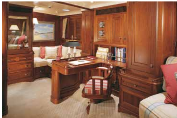
All the virtues of a modern yacht with the timeless elegance of a classic

Langan Design Associates poured intensive research and development into the Victoria project. The classic hull shape combines elegance with excellent performance. A modern underbody with refined keel and rudder shapes provides outstanding balance and speed. State-of-the-art carbon-fibre masts with Leisure furl booms and fully battened main and mizzen sails are at the heart of a powerful sail plan, complementing a sophisticated and fully integrated performance package.